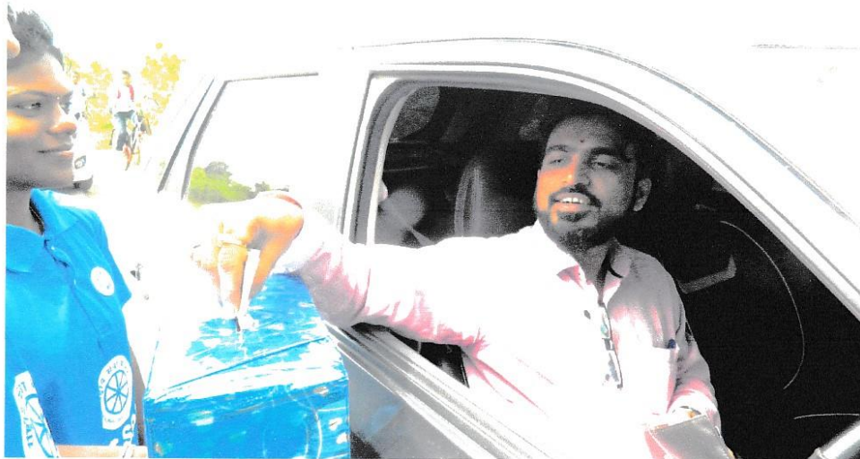
Flood Donation – Photo - 16-08-2019